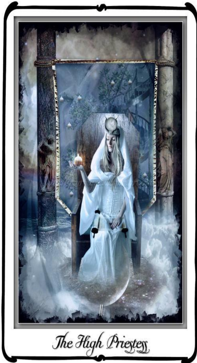
The High Priestess card, from the Mystic Dreamer Tarot , created by Heidi Darras, and published by Llewellyn, in 2008.

Now, I have conducted what I refer to as “general overview” readings, when no specific questions are asked (this is mostly done at parties and psychic fairs, due to time constraints and the number of people I see at these events).